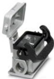
HEAVYCON box mounting base B6, with single locking latch and cover. Height 52 mm, with supports 2xM20

Please be informed that the data shown in this PDF Document is generated from our Online Catalog. Please find the complete data in the user's documentation. Our General Terms of Use for Downloads are valid ( http://phoenixcontact.com/download )