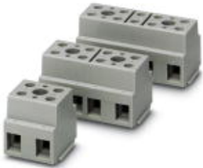
Device terminal block, for direct mounting, 5-pos.

Please be informed that the data shown in this PDF Document is generated from our Online Catalog. Please find the complete data in the user's documentation. Our General Terms of Use for Downloads are valid ( http://phoenixcontact.com/download )