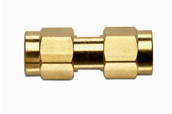
Model 72964 SMA PLUG (M) / PLUG (M)

High bandwidth, small size, and durability for confident connections.