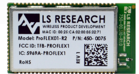
Actual size (23 mm x 41.4 mm)