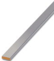
PEN conductor busbar, 3x10 mm, length: 2000 mm

Please be informed that the data shown in this PDF Document is generated from our Online Catalog. Please find the complete data in the user's documentation. Our General Terms of Use for Downloads are valid ( http://download.phoenixcontact.com )