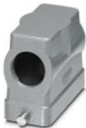
HEAVYCON B16 sleeve housing, for single locking latch, height: 76 mm, with 1 x M25 thread, lateral cable outlet

Please be informed that the data shown in this PDF Document is generated from our Online Catalog. Please find the complete data in the user's documentation. Our General Terms of Use for Downloads are valid ( http://phoenixcontact.com/download )