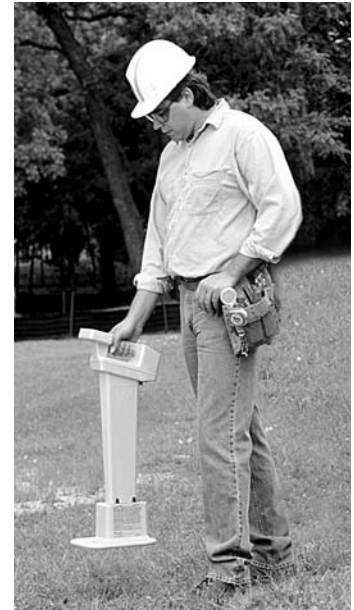
The 3M™ Dynatel™ Cable Locator 2250 can be used with the Dynatel 2205/2206 EMS Marker Locating Accessory.

For cable path locating, the 2250 receiver uses one of four user-selected locating modes – dual peak, dual null, differential or special peak (which increases the sensitivity of the receiver for tracing over longer distances). The mode is selected depending on which is most effective under the locating conditions.