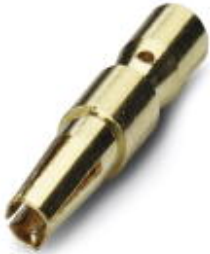
Crimp contact, turned, contact diameter: 1.5 mm, crimp range: 0.08 mm 2 ... 0.22 mm 2

Please be informed that the data shown in this PDF Document is generated from our Online Catalog. Please find the complete data in the user's documentation. Our General Terms of Use for Downloads are valid ( http://phoenixcontact.com/download )