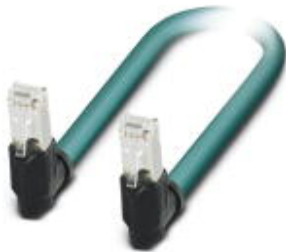
Patch cable, CAT5e, 4-pair, shielded, line, assembled at both ends with angled RJ45/IP20 heads, length: 2 m

Please be informed that the data shown in this PDF Document is generated from our Online Catalog. Please find the complete data in the user's documentation. Our General Terms of Use for Downloads are valid ( http://phoenixcontact.com/download )