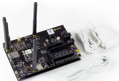
ARTIK 5 DEVELOPER KIT CONTENTS (ABOVE)