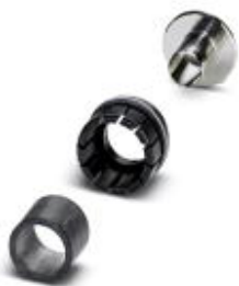
Cable clamp type cage and shield adapter, shielded: yes, Litz wire bundle diameter: 5.8 mm, Cable diameter: 7.5 mm...9.5 mm

Please be informed that the data shown in this PDF Document is generated from our Online Catalog. Please find the complete data in the user's documentation. Our General Terms of Use for Downloads are valid ( http://phoenixcontact.com/download )