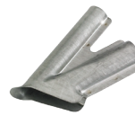
Plastic Welding Nozzle 2.0" x 1.3" x .4" No. 07091