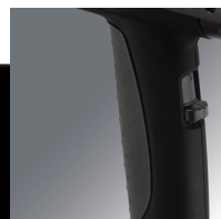
Soft Grip Handle