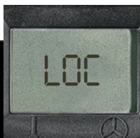
LOC Lockable Override Control