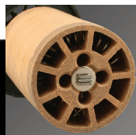
DuraTherm™ Heating Element