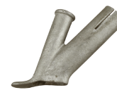
Welding Nozzle 2.6" x 1.2" x .5" No. 07531