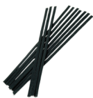
ThermoFlex™ Welding Rods 12" x 1.1" x 0.6" No. 07352