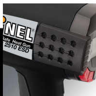
Dual Air Filters