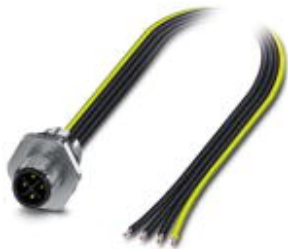
Flush-type connector, Power, 4-position, Socket, Link: M12, S power, Front mounting, M16 x 1.5, Individual wires, Cable length: 0.5 m

Please be informed that the data shown in this PDF Document is generated from our Online Catalog. Please find the complete data in the user's documentation. Our General Terms of Use for Downloads are valid ( http://phoenixcontact.com/download )