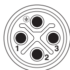
Connector pin assignment of M12 plug, 4-pos., S-coded, view of pin side