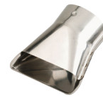
50 mm Window Nozzle 2.2" x 2.2" x 1.4" No. 07031