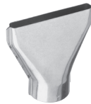
75 mm Spreader Nozzle 3.1" x 3.0" x 1.4" No. 07021