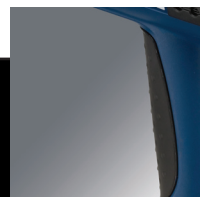
Soft Grip Handle