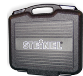
Heavy Duty Carrying Case 14.5" x 4.0" x 14.0" No. 40100