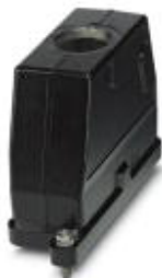
HEAVYCON B24 sleeve housing, HPR series, with screw locking, with M32 thread, straight outlet, for increased environmental and EMC requirements

Please be informed that the data shown in this PDF Document is generated from our Online Catalog. Please find the complete data in the user's documentation. Our General Terms of Use for Downloads are valid ( http://phoenixcontact.com/download )