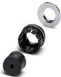
Cable clamp type cage and shield adapter, shielded: yes, cable diameter range: 2 mm ... 10.5 mm

Please be informed that the data shown in this PDF Document is generated from our Online Catalog. Please find the complete data in the user's documentation. Our General Terms of Use for Downloads are valid ( http://phoenixcontact.com/download )