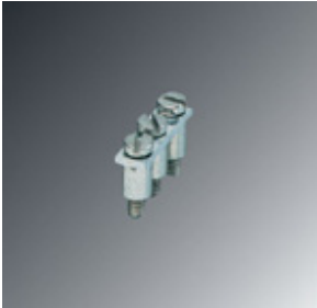
Fixed bridge, number of positions: 3, color: silver

Please be informed that the data shown in this PDF Document is generated from our Online Catalog. Please find the complete data in the user's documentation. Our General Terms of Use for Downloads are valid ( http://phoenixcontact.com/download )