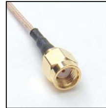
SMA Plug Reverse Polarity (AH)