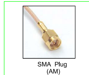
SMA Plug (AM)