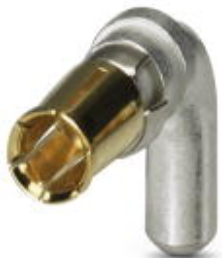
POWER contact, for D-SUB combination inserts, for PCB assembly, socket, angled, rated current 40 A, gold-plated

Please be informed that the data shown in this PDF Document is generated from our Online Catalog. Please find the complete data in the user's documentation. Our General Terms of Use for Downloads are valid ( http://phoenixcontact.com/download )