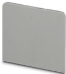
Separating plate, width: 0.5 mm, color: gray

Please be informed that the data shown in this PDF Document is generated from our Online Catalog. Please find the complete data in the user's documentation. Our General Terms of Use for Downloads are valid ( http://phoenixcontact.com/download )