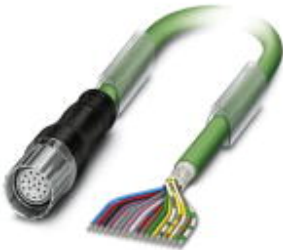
Cable plug in molded plastic, Length: 2 m, Color of outer sheath: green

Please be informed that the data shown in this PDF Document is generated from our Online Catalog. Please find the complete data in the user's documentation. Our General Terms of Use for Downloads are valid ( http://phoenixcontact.com/download )