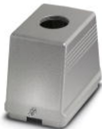
HEAVYCON sleeve housing B48, for single locking latch, height 96 mm, with thread 1x M50, straight conductor exit

Please be informed that the data shown in this PDF Document is generated from our Online Catalog. Please find the complete data in the user's documentation. Our General Terms of Use for Downloads are valid ( http://phoenixcontact.com/download )