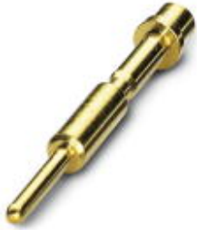
Crimp contact, turned, Single contact, contact diameter: 1 mm, crimp range: 0.34 mm 2 ... 0.5 mm 2

Please be informed that the data shown in this PDF Document is generated from our Online Catalog. Please find the complete data in the user's documentation. Our General Terms of Use for Downloads are valid ( http://phoenixcontact.com/download )