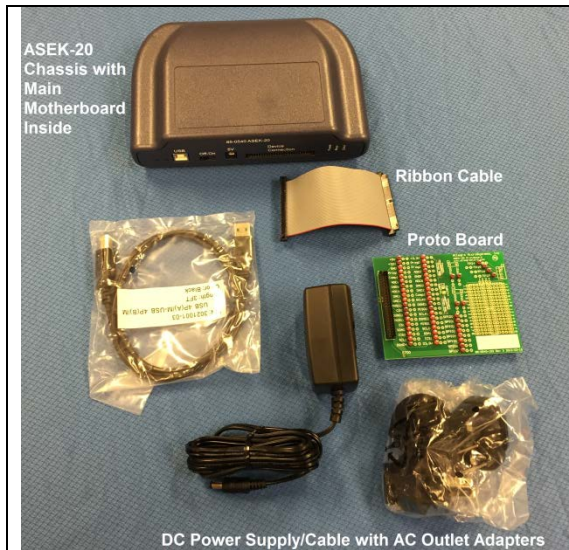
Figure 1. ASEK 20 Kit