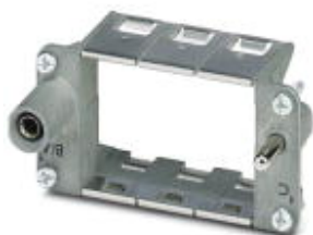
Module carrier frame, Size: B10, Type: for the sleeve side (A, B, C, ...), 4 mm 2 ... 6 mm 2 , Application: Module carrier frame

Please be informed that the data shown in this PDF Document is generated from our Online Catalog. Please find the complete data in the user's documentation. Our General Terms of Use for Downloads are valid ( http://phoenixcontact.com/download )