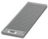
Plastic magazine for CMS-P1 plotter. Accepts 22 Zack band strips