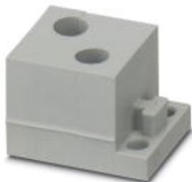
Cable sleeve, no. of conductors: 2, length: 29.5 mm, width: 19.5 mm, height: 17 mm, external cable diameter: 2x 6.4 mm ... 6.7 mm , color: gray

Please be informed that the data shown in this PDF Document is generated from our Online Catalog. Please find the complete data in the user's documentation. Our General Terms of Use for Downloads are valid ( http://phoenixcontact.com/download )