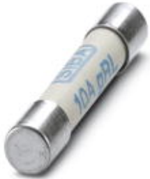
Fuse, nominal current: 10 A, length: 31.8 mm, diameter: 6.35 mm

Please be informed that the data shown in this PDF Document is generated from our Online Catalog. Please find the complete data in the user's documentation. Our General Terms of Use for Downloads are valid ( http://phoenixcontact.com/download )