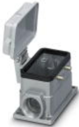
HEAVYCON box mounting base B10, with double locking latch, height 52 mm, with supports 2xM25, with protective cover

Please be informed that the data shown in this PDF Document is generated from our Online Catalog. Please find the complete data in the user's documentation. Our General Terms of Use for Downloads are valid ( http://download.phoenixcontact.com )