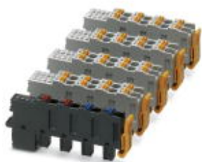
Axioline F connector set (for e.g., AXL F DO32/1 1F)

Please be informed that the data shown in this PDF Document is generated from our Online Catalog. Please find the complete data in the user's documentation. Our General Terms of Use for Downloads are valid ( http://phoenixcontact.com/download )