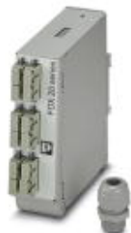
DIN rail splice box, fully mounted ready to splice, for 6x SC duplex (OM4)

Please be informed that the data shown in this PDF Document is generated from our Online Catalog. Please find the complete data in the user's documentation. Our General Terms of Use for Downloads are valid ( http://phoenixcontact.com/download )